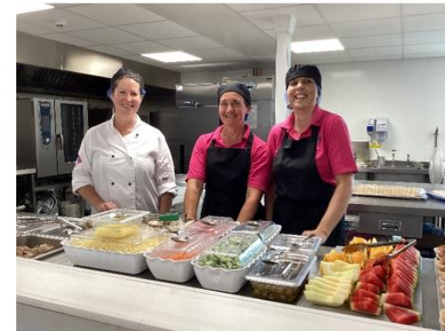
The Kitchen Ladies